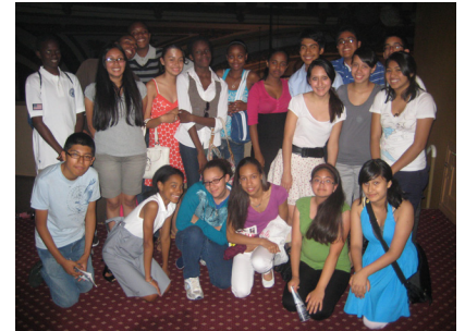
Cast of the EHS 08-09 Drama Performance

Targeted Developmental Guidance: EHS maintained weekly advisory and monthly gender groups, sessions in which students are divided by gender and discuss gender specific issues with a member of EHS faculty and staff. EHS continued to provide weekly reading groups for fifth and sixth grade students to provide opportunities to improve reading comprehension, discussion, and