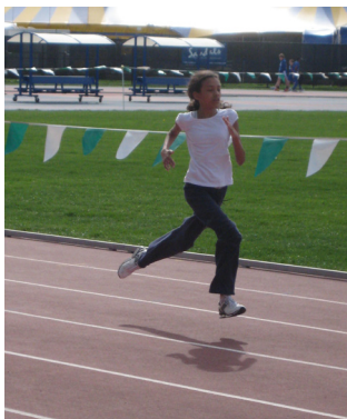
A member of the EHS track team