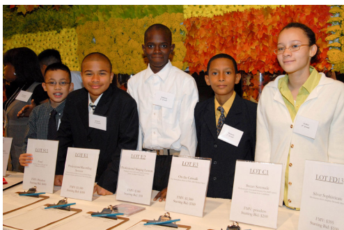
Students at the 2008 Fall Benefit

Improved and strengthened the alumni program: The EHS alumni program serves all of our alumni in high school and college by providing summer fellowships for community service, assistance with the college application process, tutoring, counseling, life-skills workshops, and internships. All alumni in high school were visited by a member of the