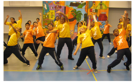
Students performing a dance piece as part of the National Dance Institute workshop

Expanded Athletics Program: A full-time Physical Education teacher was hired this year, which allowed the school to offer gym four days a week now instead of three and increased the amount of focused exercise our students receive each week. We now separate our 5th and 6th graders from our 7th and 8th graders for sports. The 7th and 8th graders are able to participate in competitive sports teams with tryouts, daily practices, and games against other schools. The 5th and 6th graders have gym built into their daily schedule and are able to focus on learning the basics of fitness, coordination, and competitive sports. The curriculum has focused not only on physical fitness, but also on sportsmanship and teamwork. The School continues to offer lacrosse, track, soccer, and swimming.